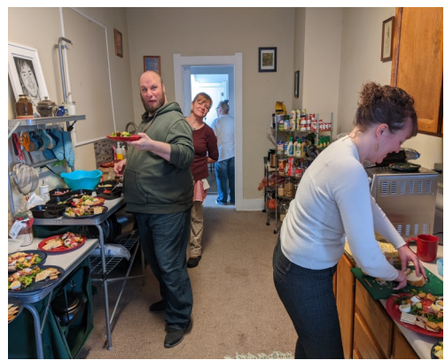
Members and staff are busy preparing lunch for the coalition guests.

Although Robbie's House is open only two days a week, the average daily attendance is 20. See <a href="https://www.robbieshouselaramie.com/">https://www.robbieshouselaramie.com/</a> for more information.