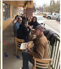
Clubhouse members are eating lunch after shopping in Old Town.