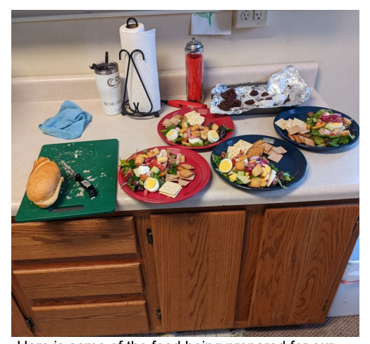
Here is some of the food being prepared for our lunch.