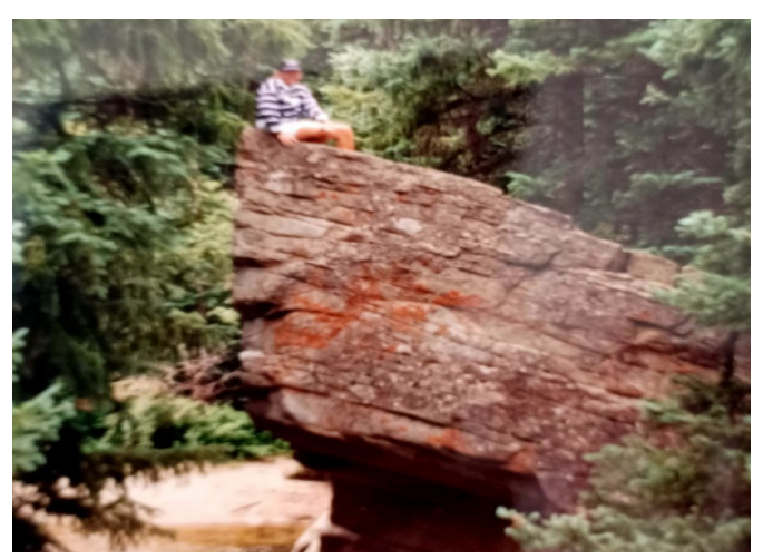
This is GB's favorite rock